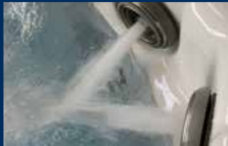
Illuminated Adjustable Jets