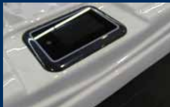
Illuminated Topside (K.1000 Standard)