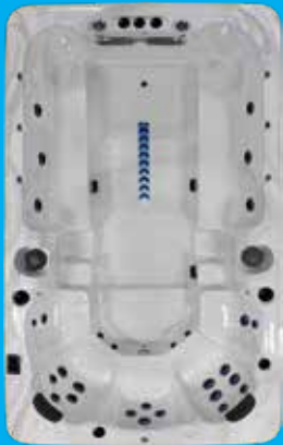
13' Aquex Party