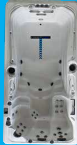
17' Aquex Pro Plus