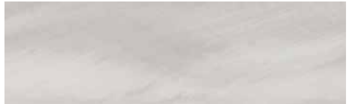
Sterling Marble - Standard