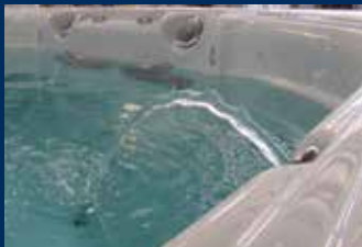
Illuminated Water Fountains