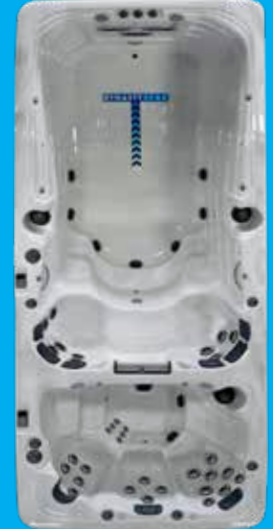
19' Aquex Dual Pro