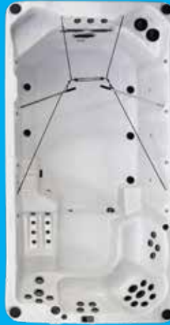
16' Aquex Trainer