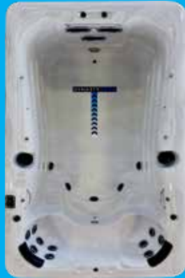
13' Aquex Pro Plus