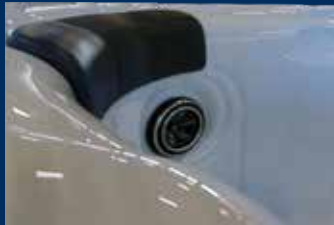
Super Soft Headrest