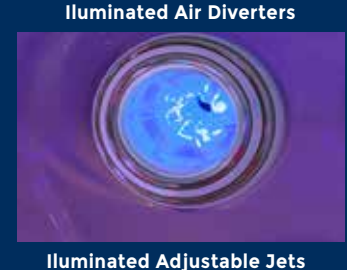
Illuminated Topside (K.1000 Standard)