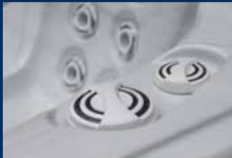
Illuminated Air Diverters