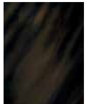
Midnight Canyon Upgrade