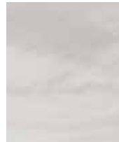
Sterling Marble Standard