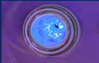
Illuminated Adjustable Jets