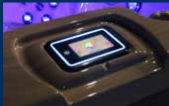
Illuminated Topsides (K.1000 Standard)