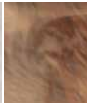
Tuscan Sun Upgrade