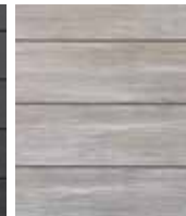
Coastal Gray Upgrade