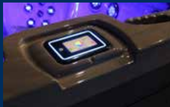
Illuminated Topsides (K.1000 Standard)