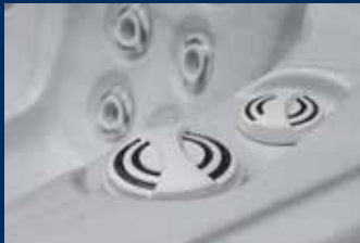
Illuminated Air Diverters