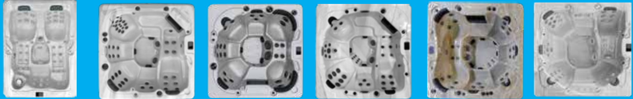
Twin Palms Nassau Royale Caribbean Breeze Coconut Bay Palm Island Paradise Bay