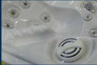
Safe Hand Grip