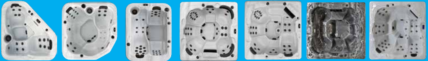
Binimi Treasure Cay Sunset Cove Tranquility Harbor Serenity Cove Ocean Breeze Cabana Bay