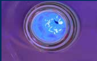
Illuminated Adjustable Jets